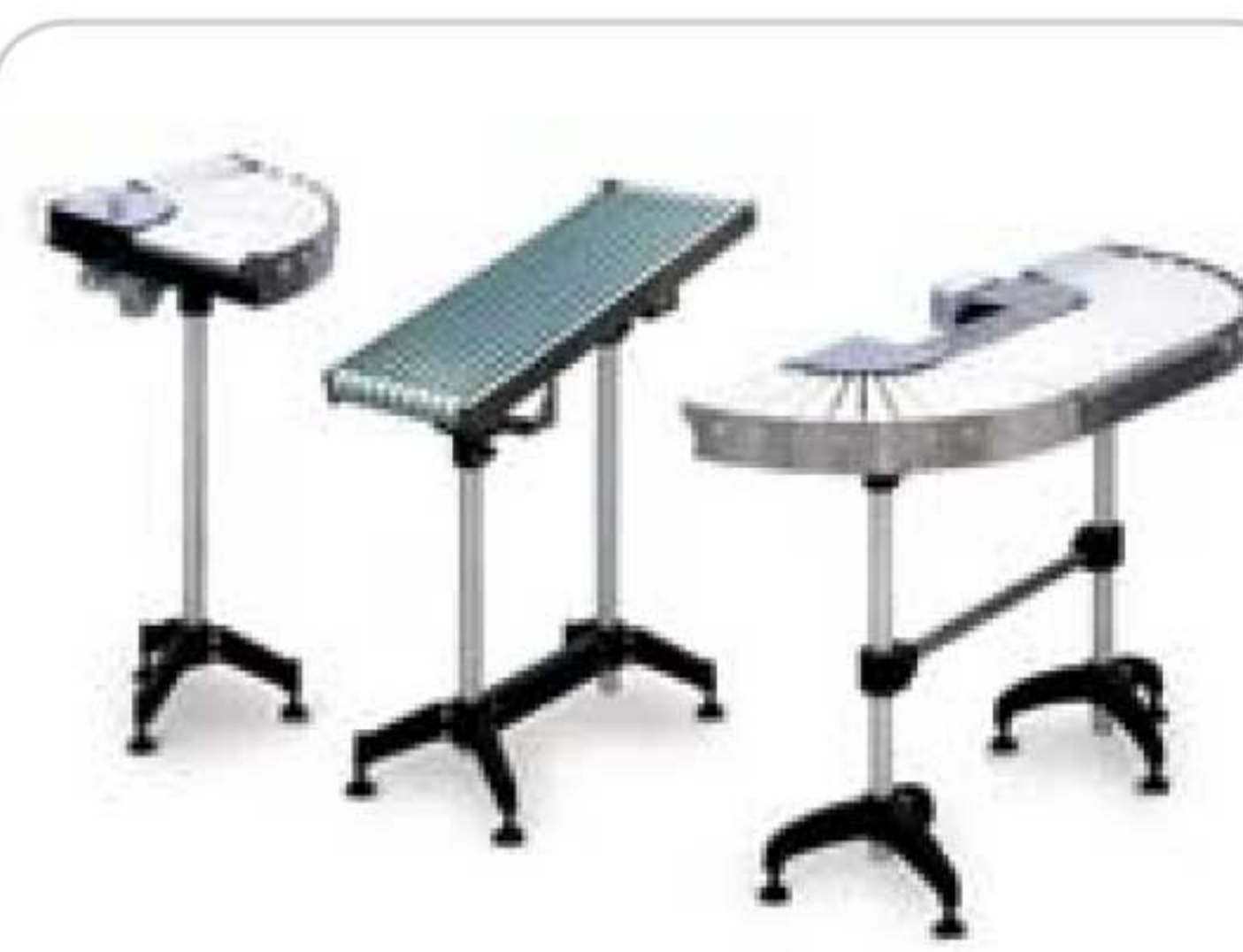
Gravity and Motorized Conveyors