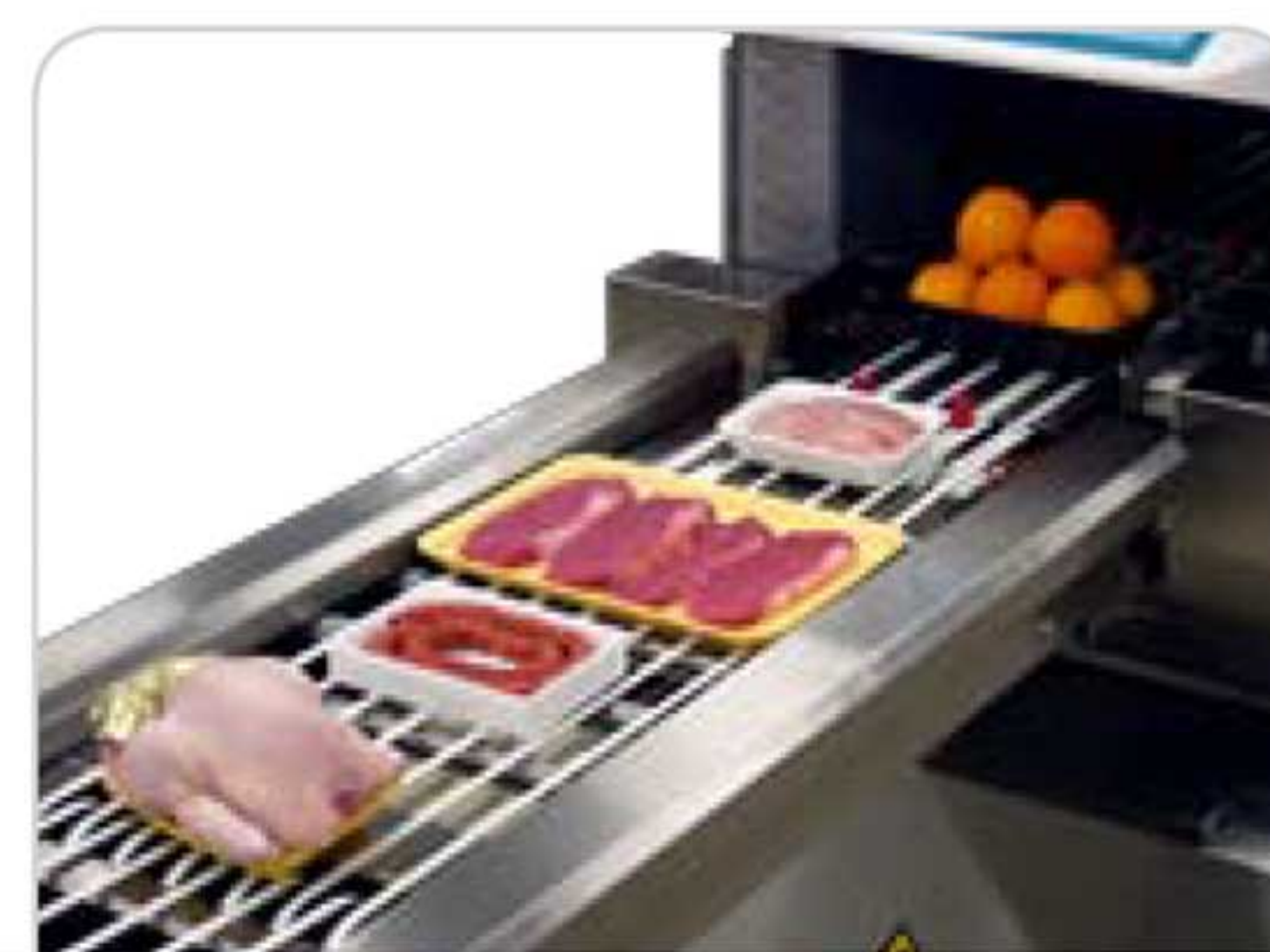
Automatic infeed conveyor with tray centering device