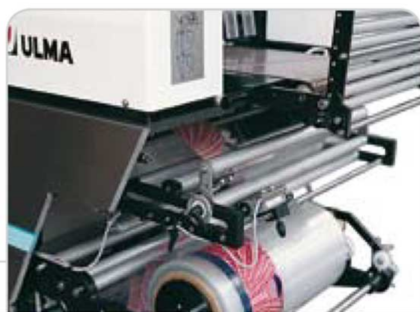
Automatic image centering device for printed film