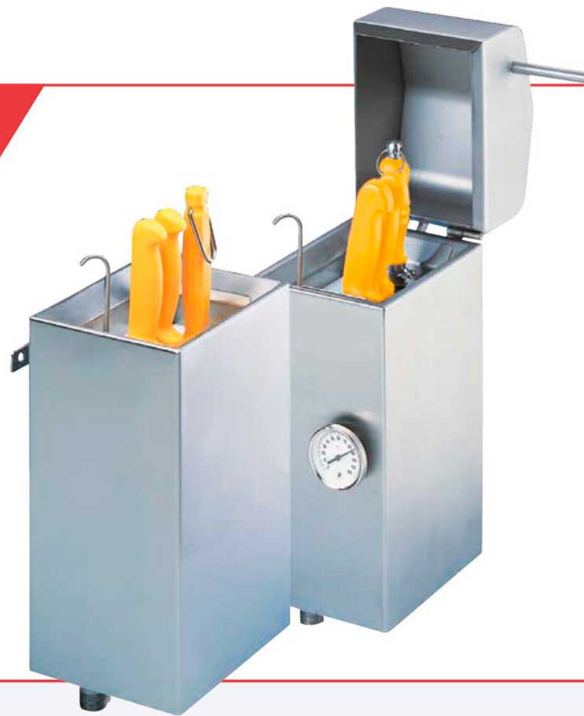
Sterilization basin type 2150